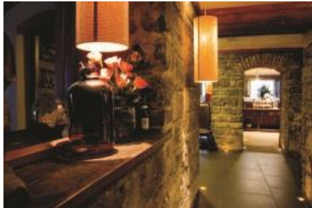
OLD HOUSE RESTAURANT